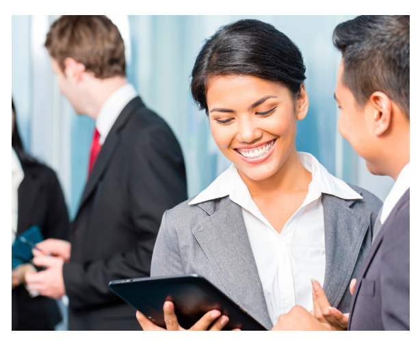
reduced by 25%. Their goal was to increase the social impact of their product.

The Handbook is an example of a growing trend of shifting the focus from outputs to outcomes when reporting on the sustainability performance of an organization. While outputs are best described as the goods, services, profits and revenues of a business (the what), outcomes include meanings, relationships and differences (the why).<sup>43</sup> For example, Unilever has demonstrated that by targeting low income consumers in the developing world by selling smaller-sized units of Lifebuoy soap and conducting handwashing campaigns, childhood diarrhea cases have been